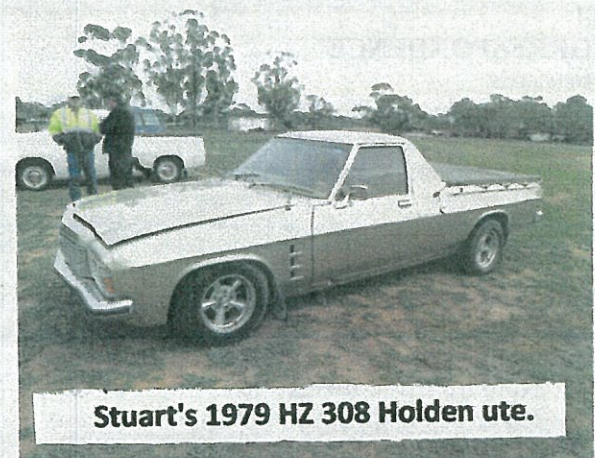
Stuart's 1979 HZ 308 Holden ute.