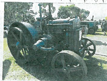
1926 CASE 18/32 cross engine.

Newsletter for Members of the Tractor Restoration and Appreciation Club Sunraysia Inc.