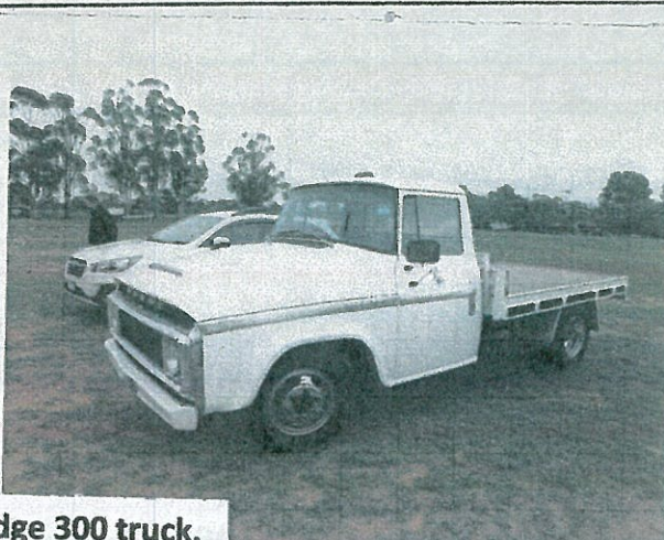
Peter's 1977 Dodge 300 truck.