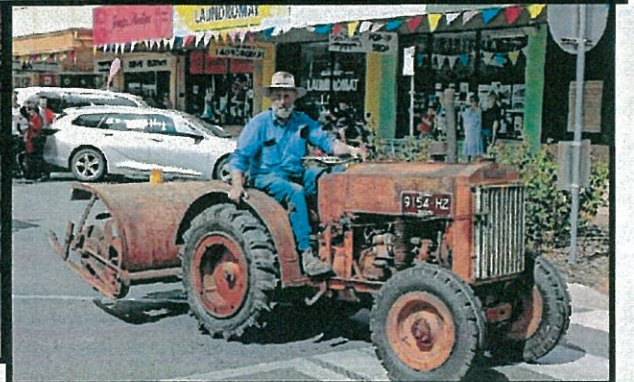
Some More Photos of TRACS at the Red Cliffs Centenary Parade. Specific acknowledgment that some are from the Red Cliffs facebook page and some by Glenn Milne.