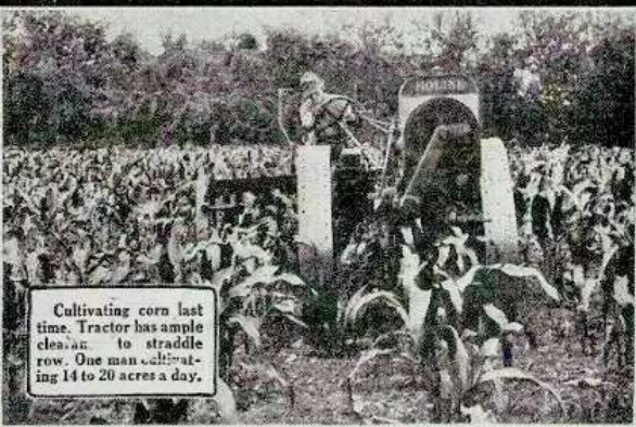
Cultivating corn last time. Tractor has ample clearance to straddle row. One man cultivating 14 to 20 acres a day.

W HEN designing the Moline-Universal Tractor we did not follow the automobile or motor truck, which are complete units in themselves and carry their loads. A farm tractor must pull its load and is useless unless operated in connection with some farm machine. Thus, we built a tractor which does the same work that farm horses do, which operates under the same conditions and in much the same manner—but faster, cheaper and better. A two-wheel type of tractor is best adapted to farm conditions, because—