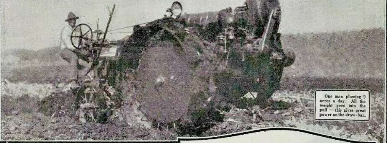
One man plowing 9 acres a day. All the weight goes into the pull — this gives great power on the draw-bar.