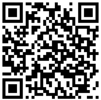
Scan the QR Code for videos of Moline Universals at work