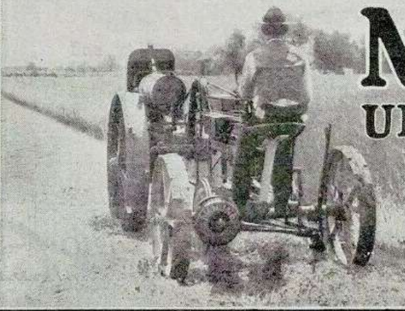
Mowing a 10-ft. swath. One man operates tractor and implement from the seat of the implement. A real one-man outfit.