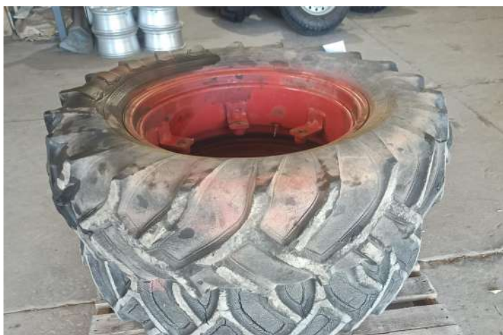
Original rear tyres from a David Brown Cropmaster. Only lasted 75 years.....

The first Caterpillar crawler was built in Stockton in California in 1925. As noted in the above list and discussed at the last meeting, an event to celebrate 100 years of Caterpillar is planned for the June long weekend at Belvedere.